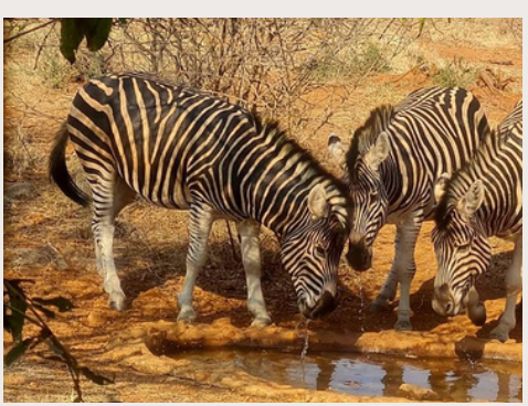
Just a few of the recent sightings our guests have shared with us...